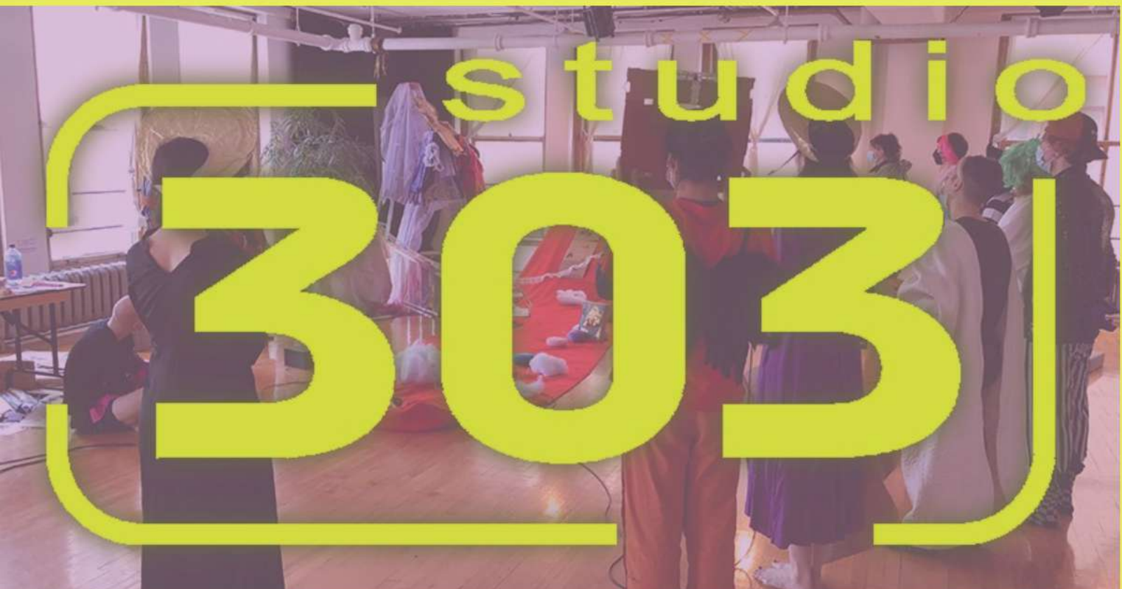
Photo credit : Queer Performance Camp, Temple for Queers 2023 by Miriam Ginestier